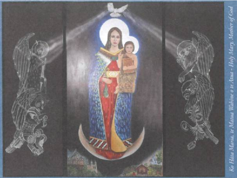
Ko Hāia Maria, te Matua Wāhine o te Atua - Holy Mary, Mother of God

St Joseph's Church 154 Brougham St, Mt Victoria, Wellington (04) 385 0915