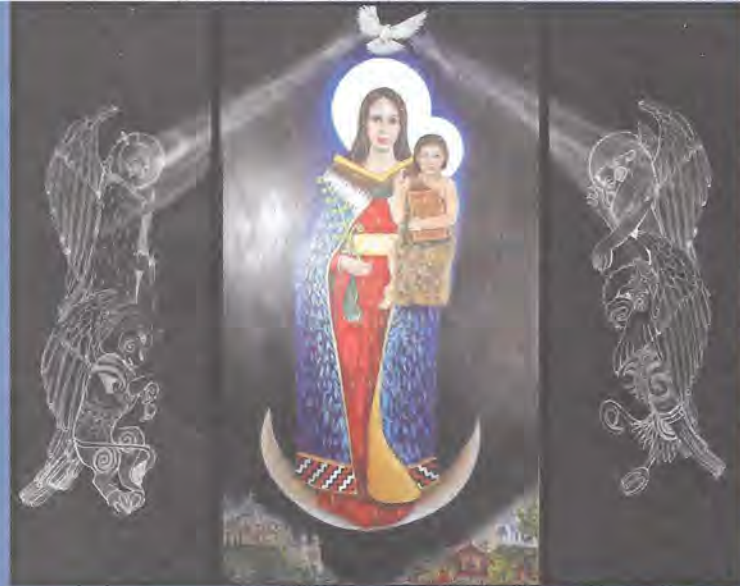
Ko Hāu Maria, te Matua Whānau o te Ariā - Holy Mary, Mother of God

St Joseph's Church 154 Brougham St, Mt Victoria, Wellington (04) 385 0915