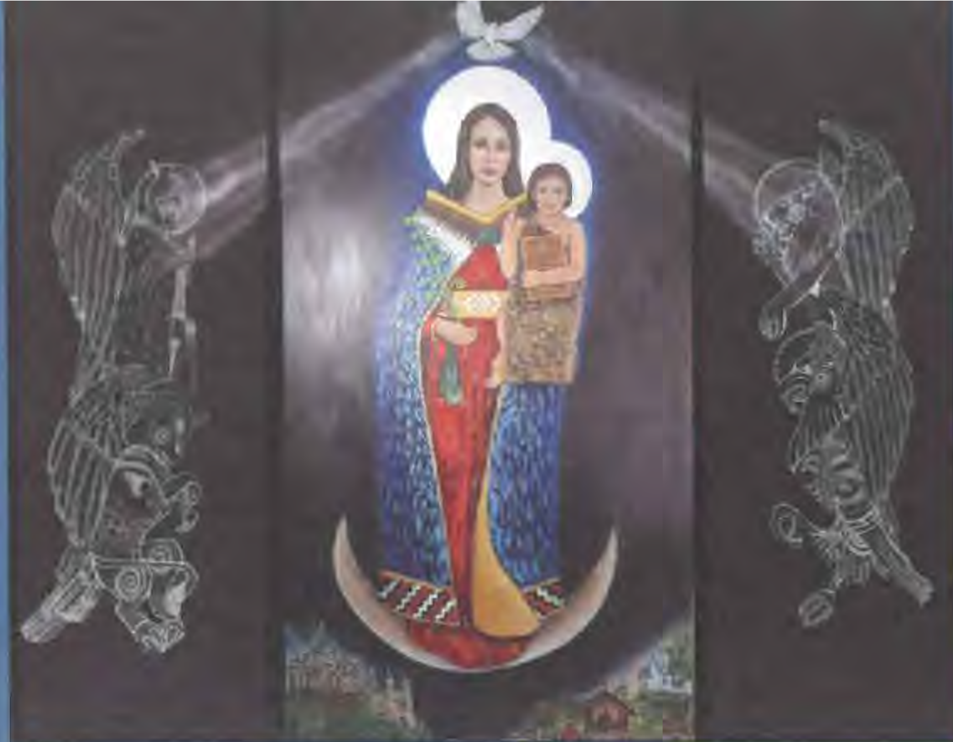
Kō Hāua Maria, te Matua Whānau o te Atua - Holy Mary, Mother of God

St Joseph's Church 154 Brougham St, Mt Victoria, Wellington (04) 385 0915