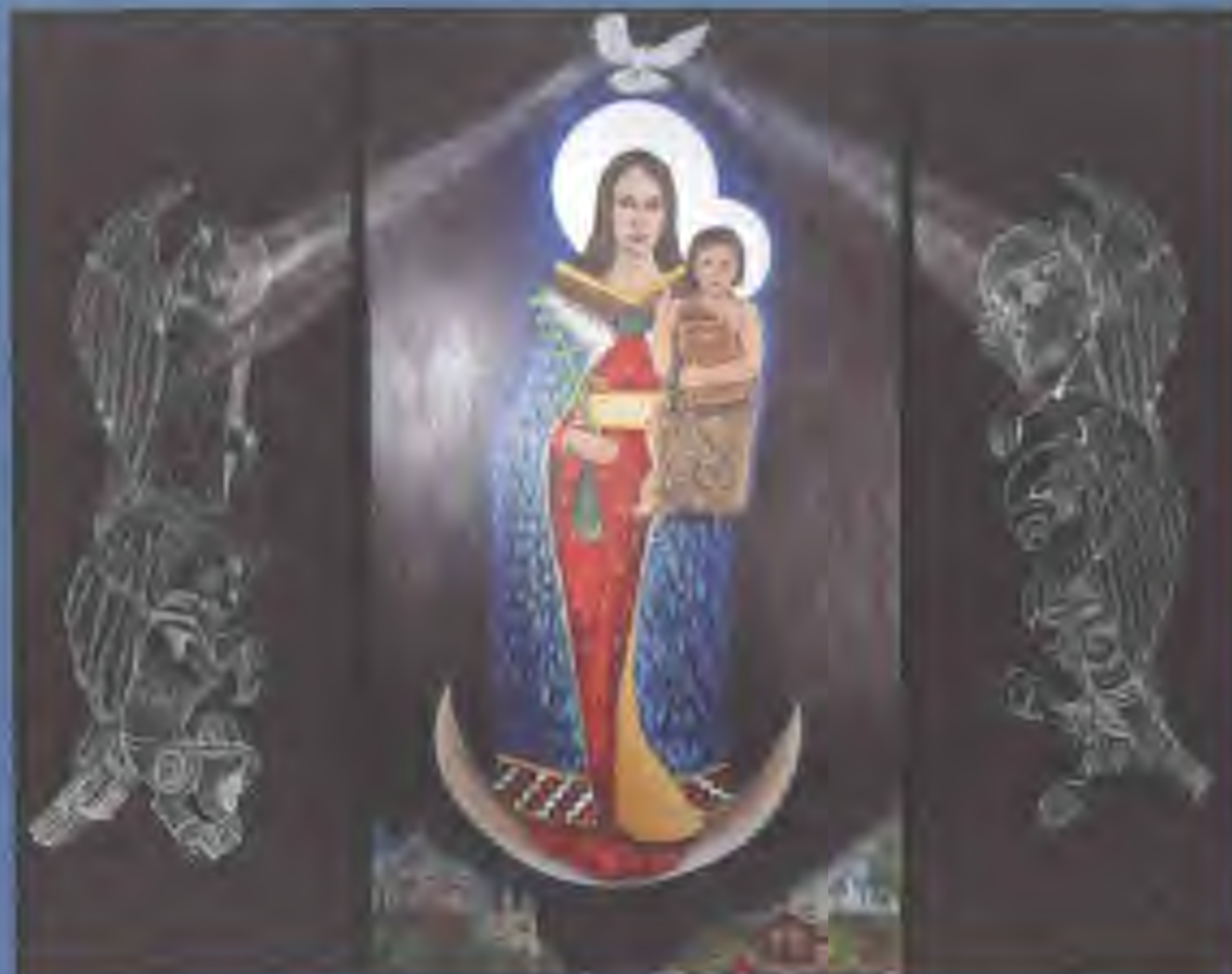
Ko Hāua Maria, te Matua Whānau o te Aroaro - Holy Mary, Mother of God

St Joseph's Church 154 Brougham St, Mt Victoria, Wellington (04) 385 0915