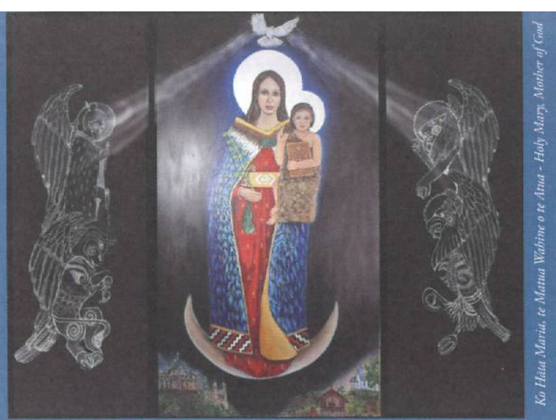
Ko Hāua Maria, te Matua Whānau o te Atua - Holy Mary, Mother of God

St Joseph's Church 154 Brougham St, Mt Victoria, Wellington (04) 385 0915