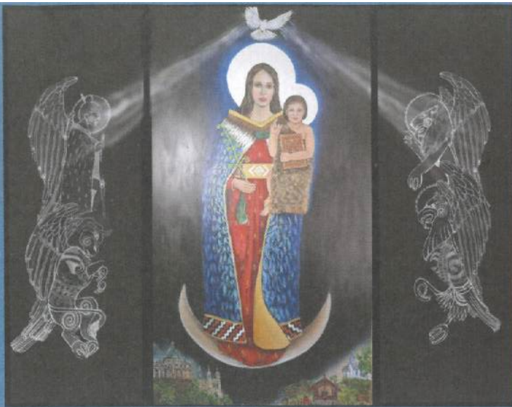
Ko Hāta Maria, te Mātua Wāhine o te Atua - Holy Mary, Mother of God

St Joseph's Church 154 Brougham St, Mt Victoria, Wellington (04) 385 0915