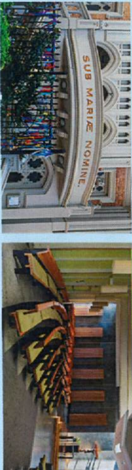
St Mary of the Angels and St Joseph's – a shared history and a new future together.

This overview document has been prepared by the Parish Pastoral Council (PPC).