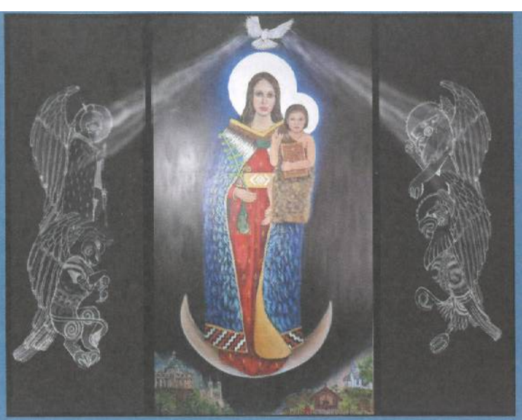
Ko Hāta Maria, te Mātua Wāhine o te Atua - Holy Mary, Mother of God

St Joseph's Church 154 Brougham St, Mt Victoria, Wellington (04) 385 0915