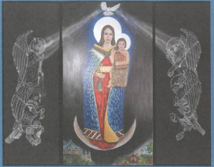
Ko Hāua Maria, te Matua Wāhine o te Atua - Holy Mary, Mother of God

St Joseph's Church 154 Brougham St, Mt Victoria, Wellington (04) 385 0915