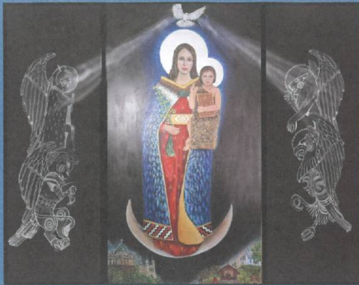
Ko Hāua Maria, te Matua Wāhine o te Atua - Holy Mary, Mother of God

St Joseph's Church 154 Brougham St, Mt Victoria, Wellington (04) 385 0915