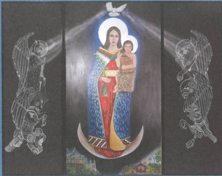
Ko Hāua Maria, te Matua Wāhine o te Atua - Holy Mary, Mother of God

St Joseph's Church 154 Brougham St, Mt Victoria, Wellington (04) 385 0915