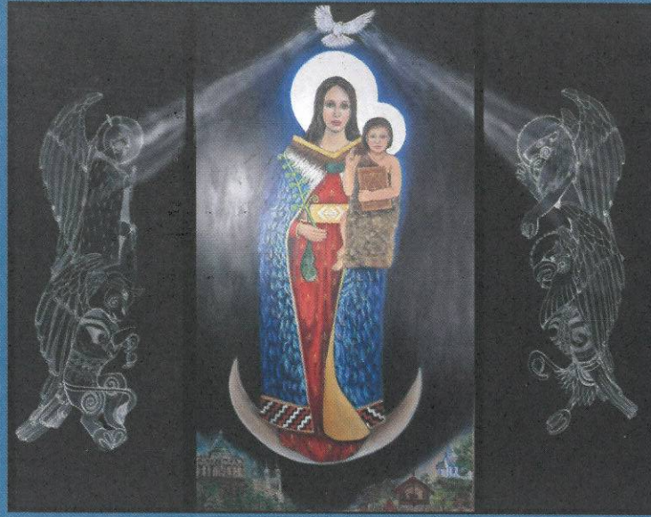
Ko Hāta Maria, te Matua Wahine o te Atua - Holy Mary, Mother of God

St Joseph's Church 154 Brougham St, Mt Victoria, Wellington (04) 385 0915