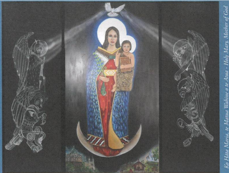
Ko Hina Maria, te Matua Wāhine o te Atua - Holy Mary, Mother of God