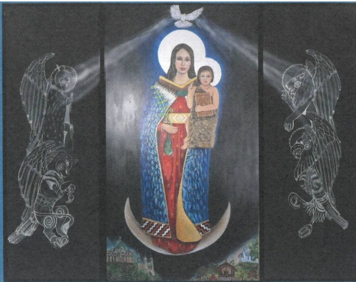
Ko Hāta Māria, te Matua Wāhine o te Ariua - Holy Mary, Mother of God

St Joseph's Church 154 Brougham St, Mt Victoria, Wellington (04) 385 0915