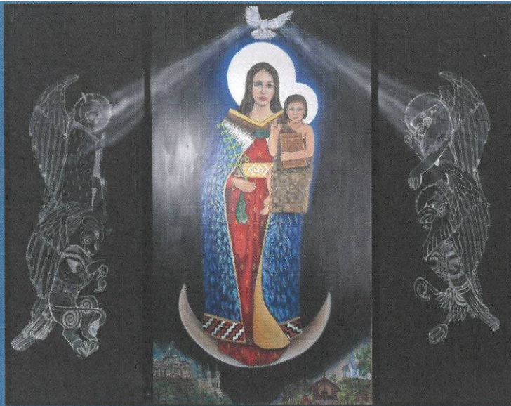
Ko Hāta Maria, te Matua Wāhine o te Atua - Holy Mary, Mother of God

St Joseph's Church 154 Brougham St, Mt Victoria, Wellington (04) 385 0915