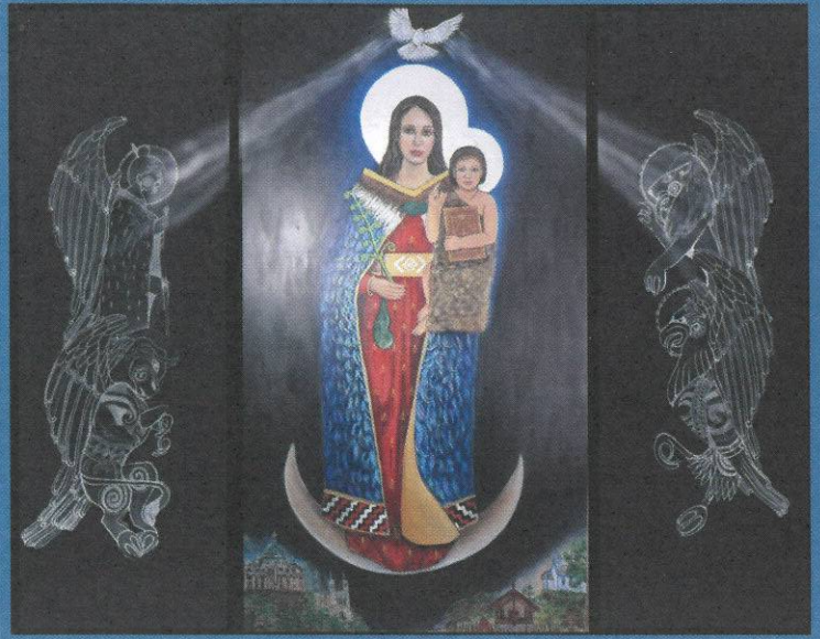
Ko Hāta Maria, te Matua Wāhine o te Atua - Holy Mary, Mother of God

St Joseph's Church 154 Brougham St, Mt Victoria, Wellington (04) 385 0915