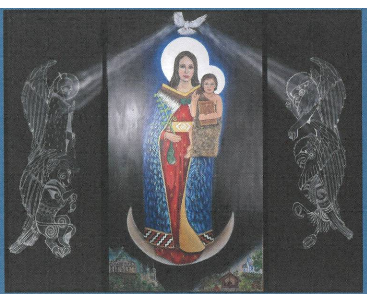
Ko Hāua Maria, te Matua Wāhine o te Atua - Holy Mary, Mother of God

St Joseph's Church 154 Brougham St, Mt Victoria, Wellington (04) 385 0915