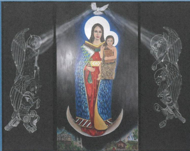
Ko Hata Maria, te Matua Wāhine o te Atua - Holy Mary, Mother of God