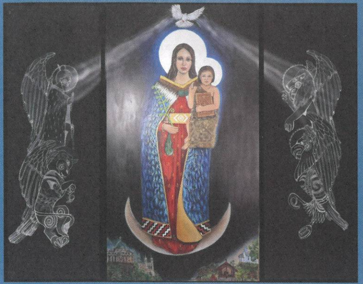
Ko Hāna Maria, te Matua Wāhine o te Aua - Holy Mary, Mother of God

St Joseph's Church 154 Brougham St, Mt Victoria, Wellington (04) 385 0915