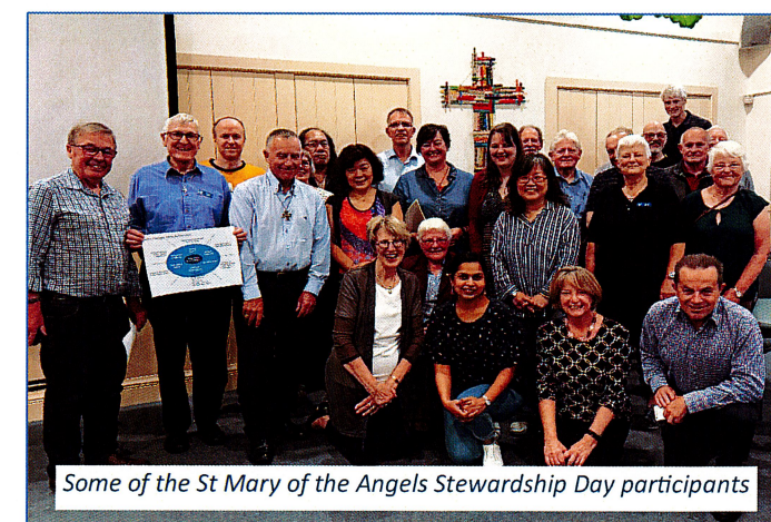
Some of the St Mary of the Angels Stewardship Day participants