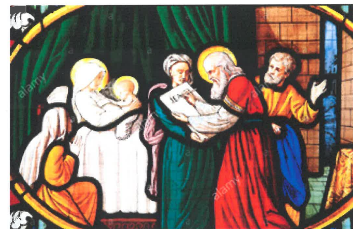
Saint-Corentin Cathedral, Stained glass window

You are invited to a Holy Hour on Tuesday 26 June beginning at 7.30 pm in the Cathedral chapel to pray for vocations to priesthood and consecrated life. This hour will include prayers, Scripture, times of silence, singing and conclude with Benediction followed by supper. All are welcome.