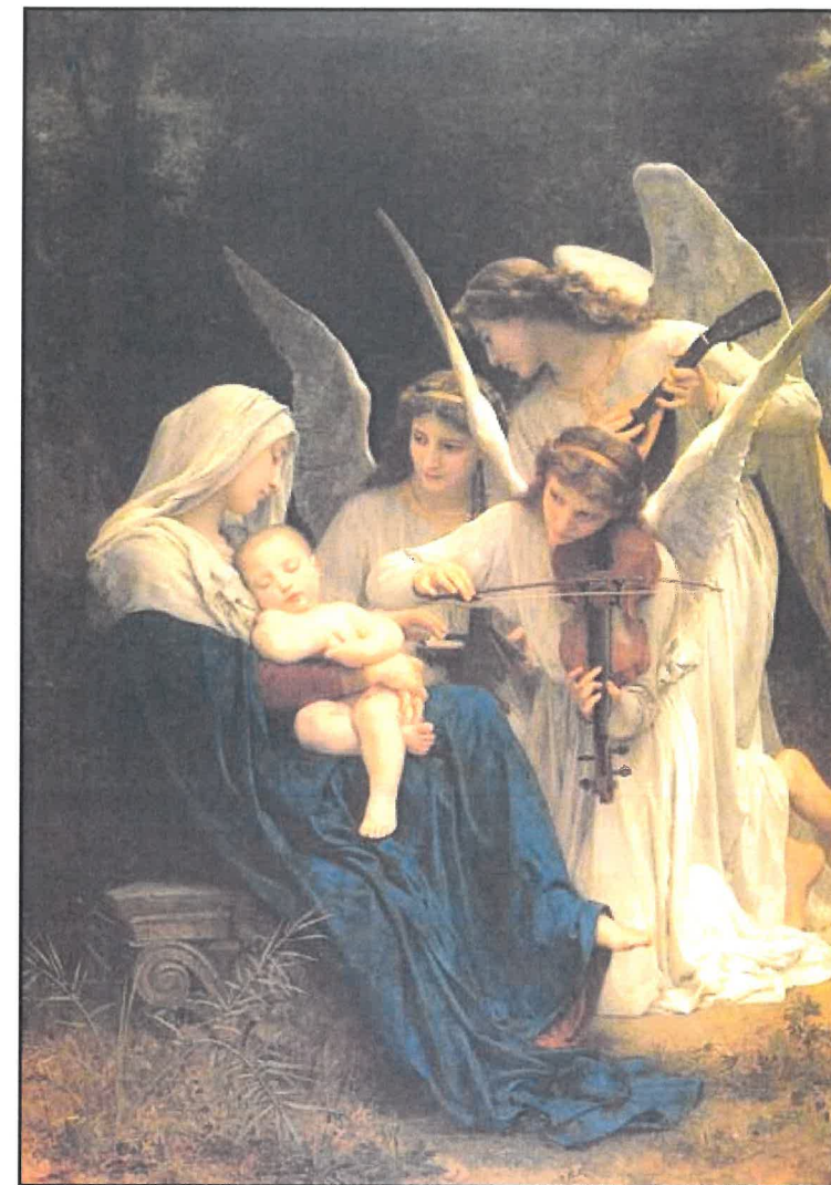
Three angels playing music for Mother Mary and baby Jesus by Bouguereau