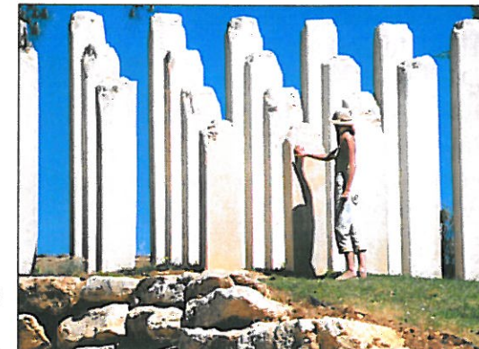
The Family and Children's Memorial, Yad Vashem

The poignant simplicity of exhibits at Yad Vashem, the Holocaust Museum, connects deeply with all who have the opportunity to visit.