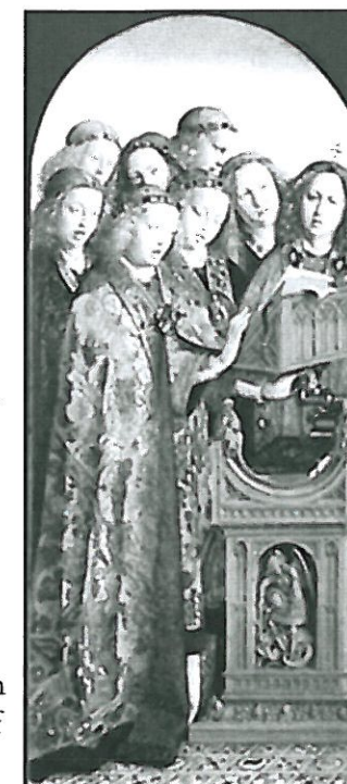
Art and the Bible