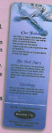
The Rosary Card © Harbour City Funeral Home

Available free upon request. Simply call and we will send the quantity you require.