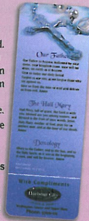
The Rosary Card © Harbour City Funeral Home

Available free upon request. Simply call and we will send the quantity you require.