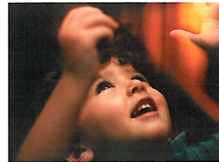
"Children stand before God with open arms"