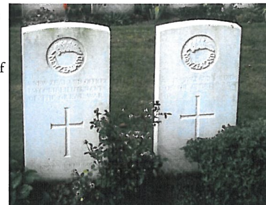
"Known unto God." Young New Zealanders, France.

There are more things that bond New Zealand and France than hard-won rugby matches. So many of our young from previous generations have died and are buried there. So many New Zealanders continue to visit war cemeteries across Europe and are deeply moved by the enduring care and respect for those who have died.