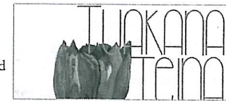
Tuakana Teina Art Show and Sale

Friday 17 June at St Joseph's Catholic Church, Mt Victoria. The Tuakana Teina Art Show and Sale features 51 artists and their work. Drinks, nibbles and great music are provided. It is a great opportunity for local established and amateur artists to exhibit and to support our Wellington Pilgrims. Tickets $25 each— from 6.45pm. Contact: 04 496 1731 or email: tuakanateina2011@gmail.com