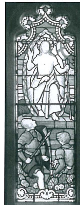
The Resurrection window at St Mary of the Angels, Wellington

St Mary of the Angels has been a place of much prayer and reflection throughout Lent and the liturgies of Easter.