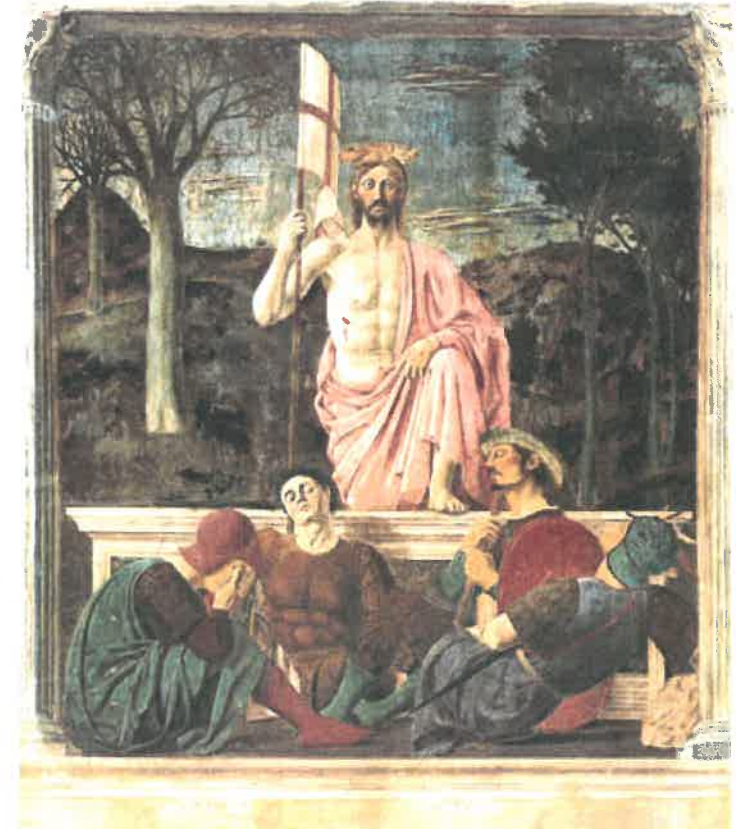
The Resurrection (Piero della Francesca - 1420-1492)