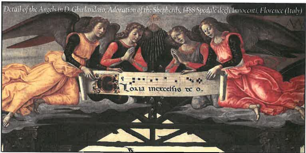
Detail of the Angels in D. Ghirlandaio, Adoration of the Shepherds, 1488 Spedale degli Innocenti, Florence (Italy)

May the Peace of the Christ Child be with you and your family this Christmas