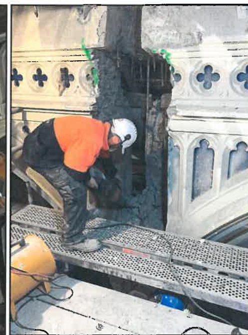
View from inside the Church of a builder preparing a portal for strengthening.