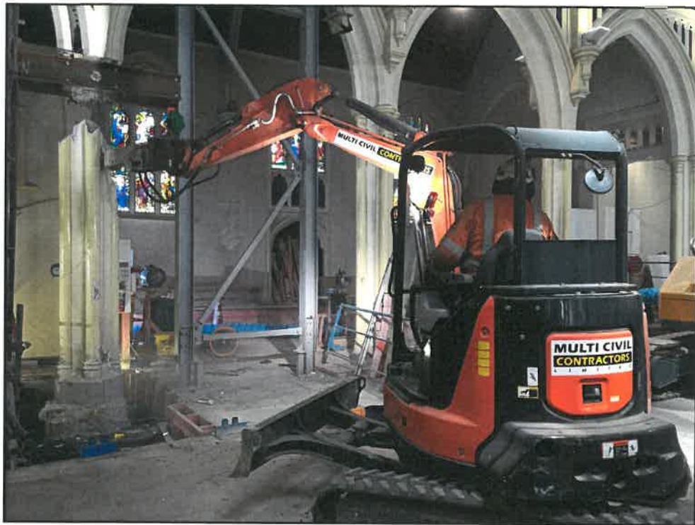
Above: View of construction inside the Church.