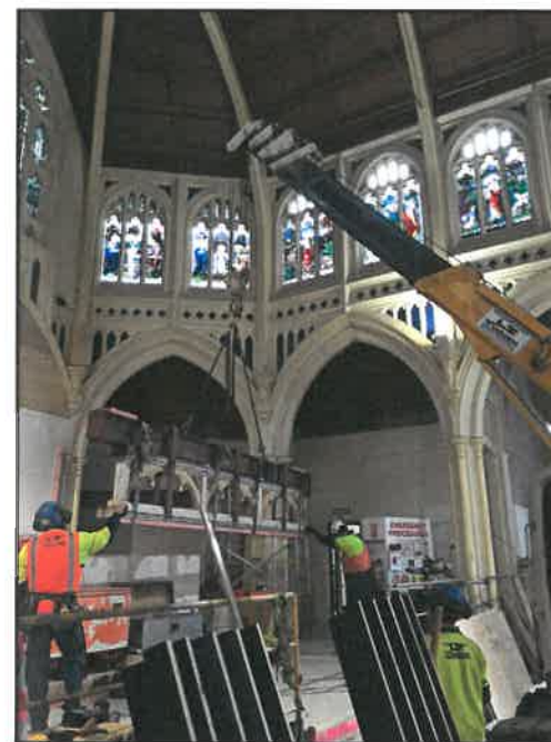
View of builders carefully removing the front marble altar rail before beginning seismic strengthening work.