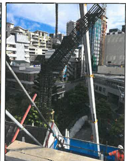
View of steel being lowered into the new portal from outside the Church.