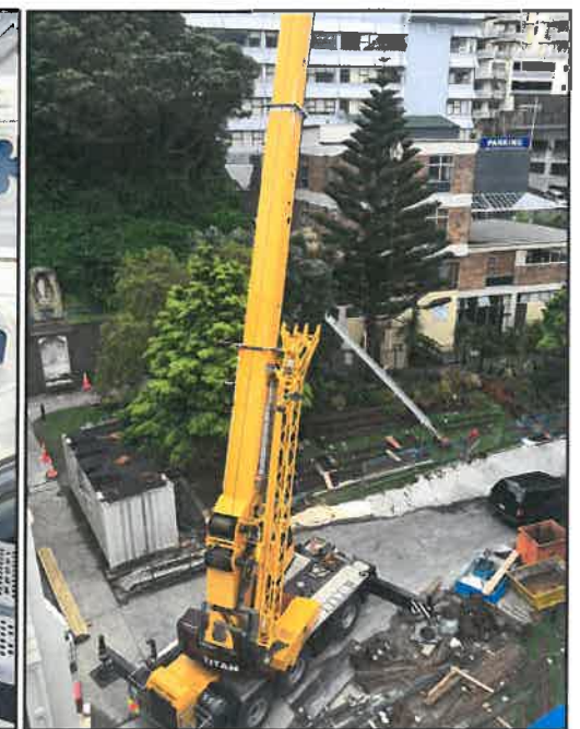
View from Church roof of the crane and worksite as the steel for the portal is being loaded for installation.