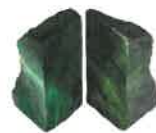
Greenstone Doors Charitable Trust

Greenstone Doors Charitable Trust is a Christian organisation working to support families through pregnancy and beyond in the Hutt Valley. Our free services include pregnancy testing, counselling, baby clothing, advocacy, and support groups.