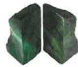
Greenstone Doors Charitable Trust

Greenstone Doors Charitable Trust is a Christian organisation working to support families through pregnancy and beyond in the Hutt Valley. Our free services include pregnancy testing, counselling, baby clothing, advocacy, and support groups.