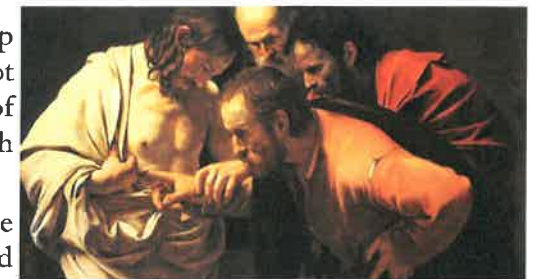
Caravaggio, c. 1601. The Incredulity of Saint Thomas

...Lord, we pray to you for all the peoples of the earth: you who have conquered death, grant us your life, grant us your peace! Dear brothers and sisters, Happy Easter!" - Pope Francis Easter 2016